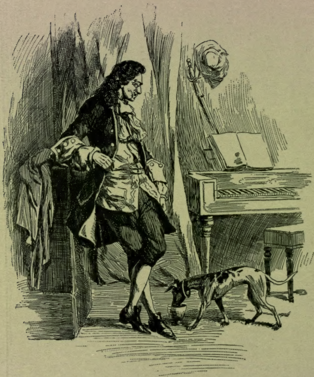
THE CHEVALIER SET MIRZA TO EAT SUGAR